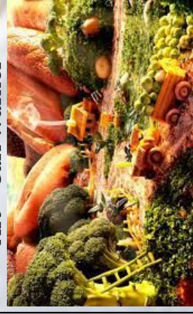
Art - Carl Warner